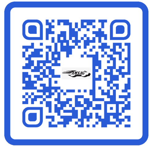
Spectator Point B