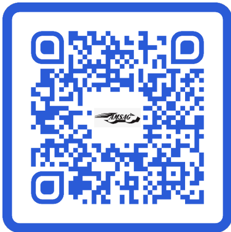
Spectator Point A

Please stand behind the bunting tape and follow the instructions of the Spectator Marshalls.